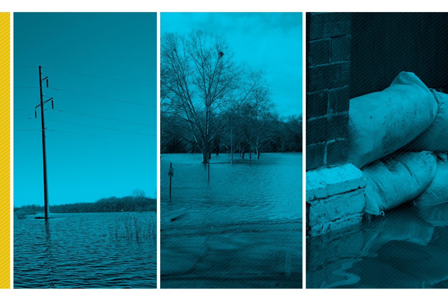
Business Flooding Toolkit